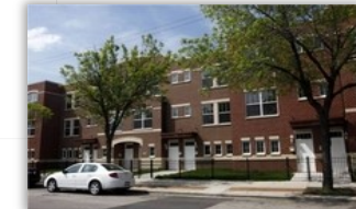
Shoreline Townhomes Chicago, IL