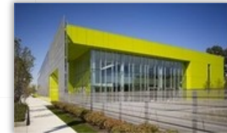
Gary Comer College Prep Chicago, IL