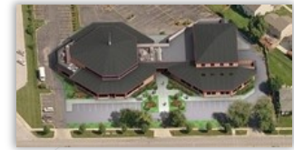
Covenant United Church of Christ Dolton, IL