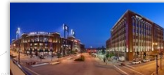
The St. Louis Westin Hotel St. Louis, MO